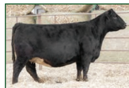
Dam – Schooley Miss 823F 068H

ASA# 4256880 • 5/8 SM 3/8 AN • Homozygous Black • Homozygous Polled