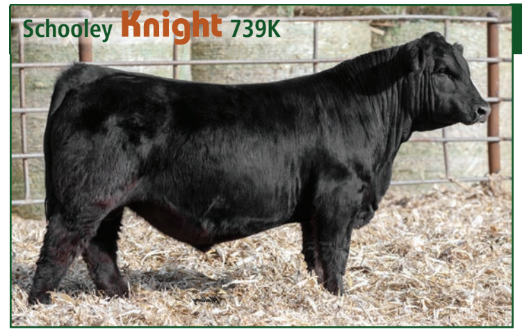
ASA# 4109339 • 3/4 SM 1/4 AN • Homozygous Black • Homozygous Polled

CDI Innovator 325D Sire: CLRWTR Game Changer H4A WS Miss Sugar C4