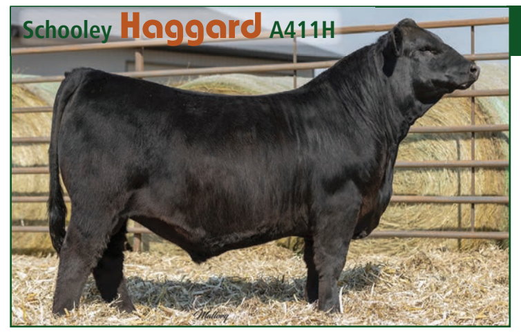
ASA# 3752744 • 1/2 SM 1/2 AN • Homozygous Black • Homozygous Polled

Billy Seay 8020 Courthouse Rd Church Rd, VA 23833 804-514-5586 william.seay@verizon.net