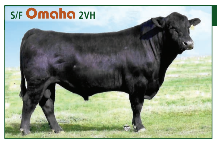
ASA# 3891307 • 1/2 SM 1/2 AN • Homozygous Black • Homozygous Polled

Quaker Hill Manning 4EX9 Sire: EWA Peyton 642 EWA 444 of 968 Progress