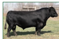
Hook's Galileo 210G, sire