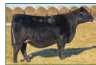
HABR Leona L340 Daughter of Amplitude