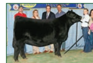
Hook's/JRA Demi 605D, maternal granddam