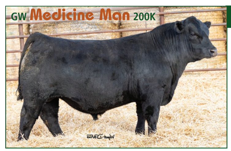
ASA# 4033441 • 5/8 SM 3/8 AN • Homozygous Black • Homozygous Polled

Leachman Prophet J030Z Sire: Southern Fortune Teller GW Miss Prem Beef 246Z