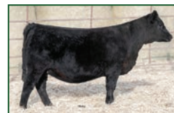
Schooley Miss 249M 454M $40,000 Daughter