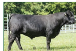
HA Justice 30J – Sire

■ Soft-made, sound, gentle, and very attractive, he offers Maternal and Carcass advancement that few others can boast with excellent Calving Ease.