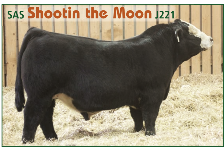
ASA# 3952112 • PB SM • Heterozygous Black • Homozygous Polled

Rust Bull 15D Sire: SRH Patriot 19F SRH Precious 73A