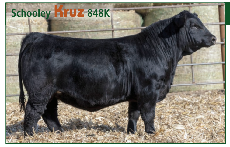
ASA# 4109342 • PB SM • Homozygous Black • Homozygous Polled

CDI Innovator 325D Sire: CLRWTR Game Changer H4A WS Miss Sugar C4