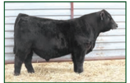
HSR Night Vision M479 – high-selling bull at Dakota Xpress Sale.

Semen: $40/unit; volume pricing available Semen available through Allied