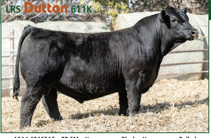
ASA# 4046516 • PB SM • Homozygous Black • Homozygous Polled

ASR American Patriot F843 Sire: ASR American Proud H0301 ASR Little Desi D6273