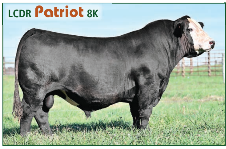
ASA# 4113651 • PB SM • Homozygous Black • Homozygous Polled

CDI Entourage 156U Sire: HHS Mr Entourage 867B HHS Miss 836Z