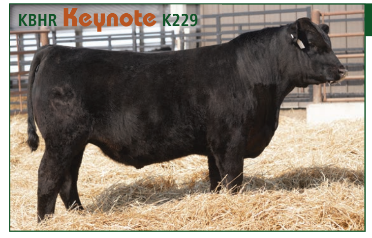
ASA# 4104347 • PB SM • Homozygous Black • Homozygous Polled

Hook's Beacon 56B Sire: CLRS Guardian 317G CLRS Always Xcellent