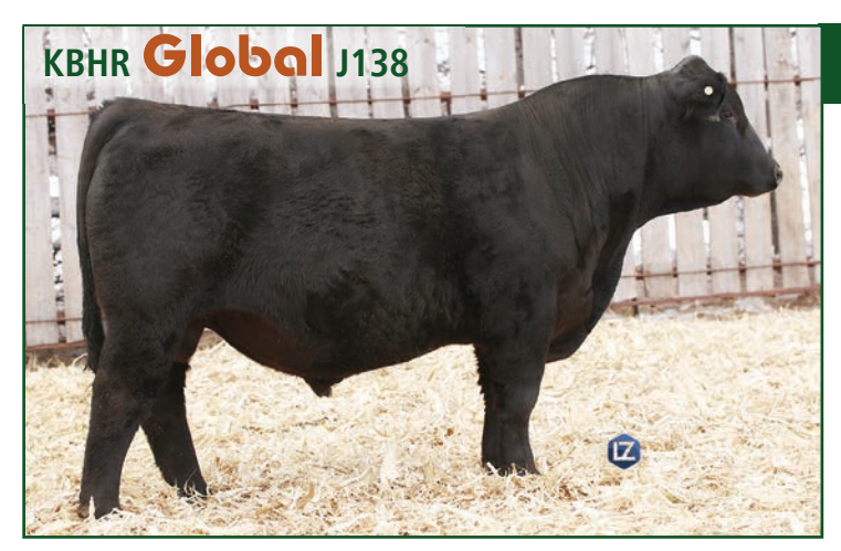
ASA# 3943850 • PB SM • Homozygous Black • Homozygous Polled

CCR Cowboy Cut 5048Z Sire: WS Proclamation E202 WS Miss Sugar C4