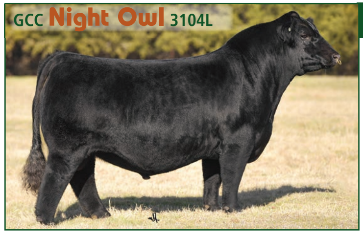
ASA# 4284092 • PB SM • Heterozygous Black • Polled

WLE Copacetic E02 Sire: Rocking P Private Stock H010 RP/MP Built To Love A021